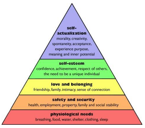
FIG 1 - MASLOW'S HIERARCHY OF HUMAN NEEDS

Each individual is responsible for their own conduct and uniform (see Appendix B), with others being able to support and guide a person to make choices that are positive. It is a key responsibility of parents and the school to educate children in how to conduct and present themselves in a positive manner that promotes self-esteem, encourages pride and fosters mutual respect, co-operation and courtesy at all times.