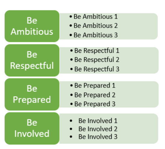
FIG 2 - REWARDS SYSTEM

It is the desire of all stakeholders that positive outcomes are achieved within all aspects of school and that is why great emphasis is placed upon the positive through a rewards system that has been developed in consultation with all stakeholders, including, students, staff, parents, and governors. Our Rewards System is linked to our core values of being ambitious, respectful, prepared and involved in the school and local community (See Fig 2). We prioritise the acknowledgment of positive behaviour and communicate this with students and parents via the ClassCharts app .