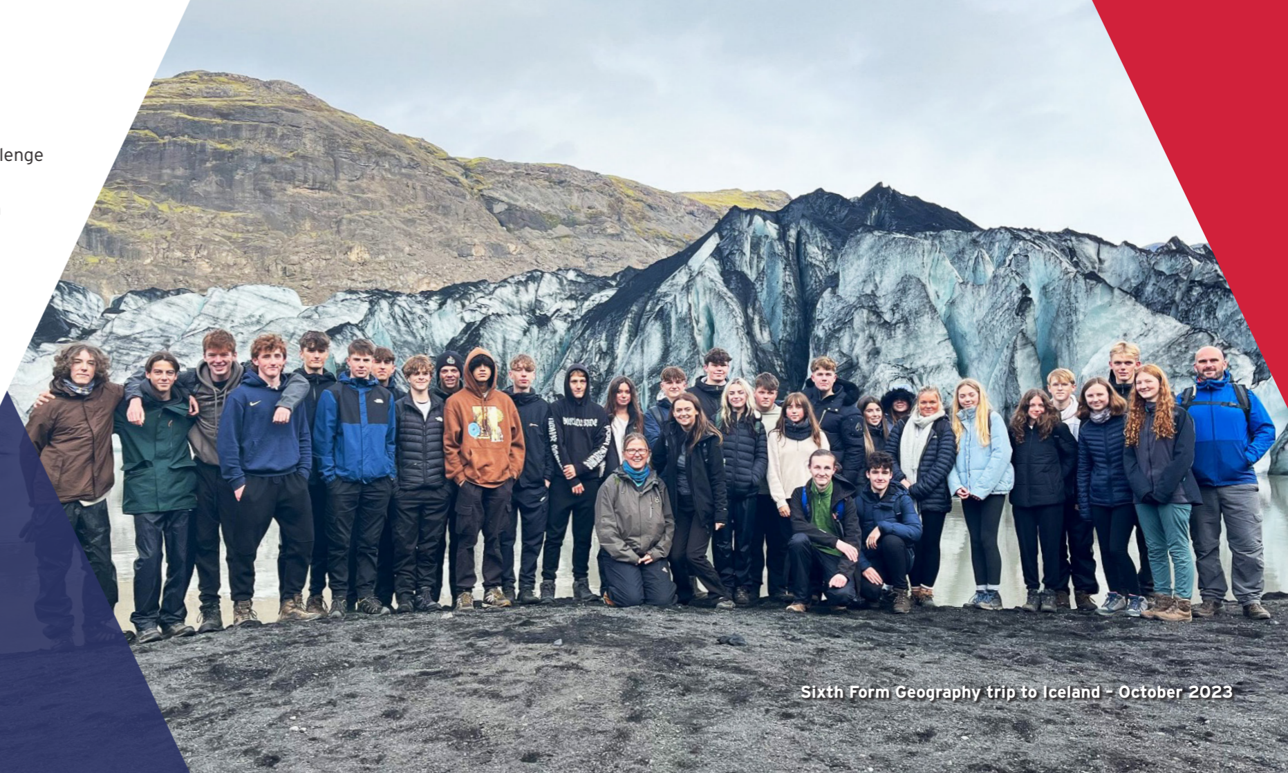
Sixth Form Geography trip to Iceland - October 2023

The Sixth Form experience is also enhanced through a personal development lesson once a fortnight which focuses on providing our young people with information and discussion opportunities on issues that affect young adults.